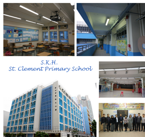
S.K.H. St. Clement Primary School

The project is now open for application. In the past two months, BEC has received overwhelming response from the school sector. We are happy to announce SKH St. Clement's Primary School is the first participant of the project. Please contact beamplusschools@bec.org.hk for enquiries and application.