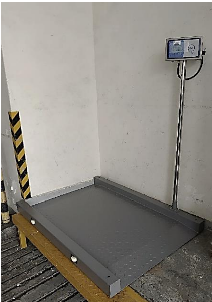
Smart waste monitoring system