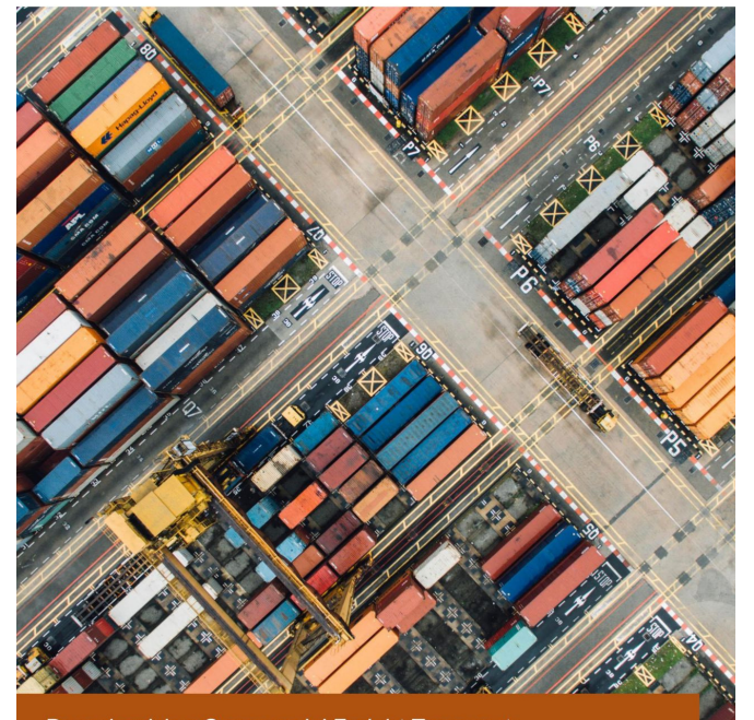
Decarbonising Commercial Freight Transport: A Greenhouse Gas Emissions Blind Spot of Companies in Hong Kong