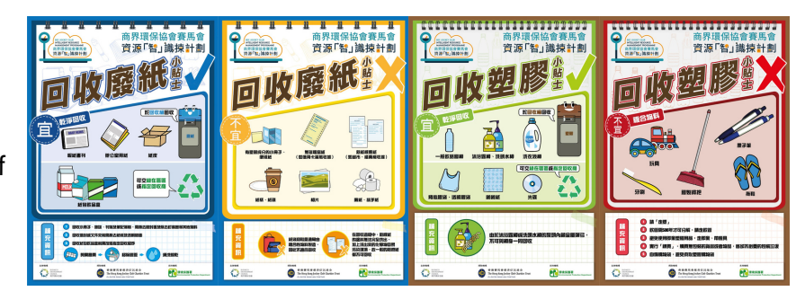
Click HERE to download the e-posters

As part of the Programme, BEC also prepared a set of recycling tips posters in late September with a view to sharing recycling knowledge and increasing awareness of tenants and residents of participating buildings. The set of posters comprised of 4 designs including 2 on paper recycling tips and 2 on plastics recycling tips.