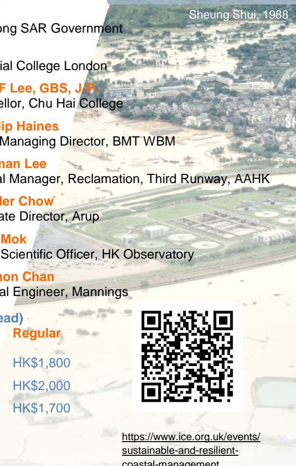
Sheung Shui, 1988